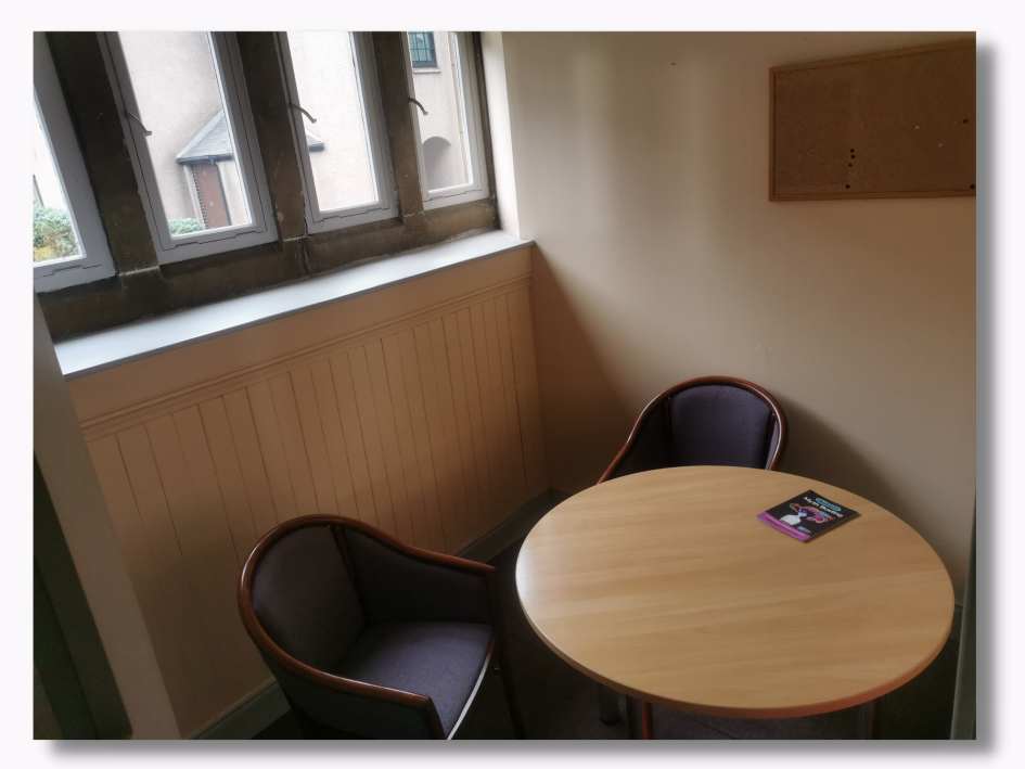
Suitable for small meetings of 2/3 people, this space is perfect for a quick meeting in a City Centre location.